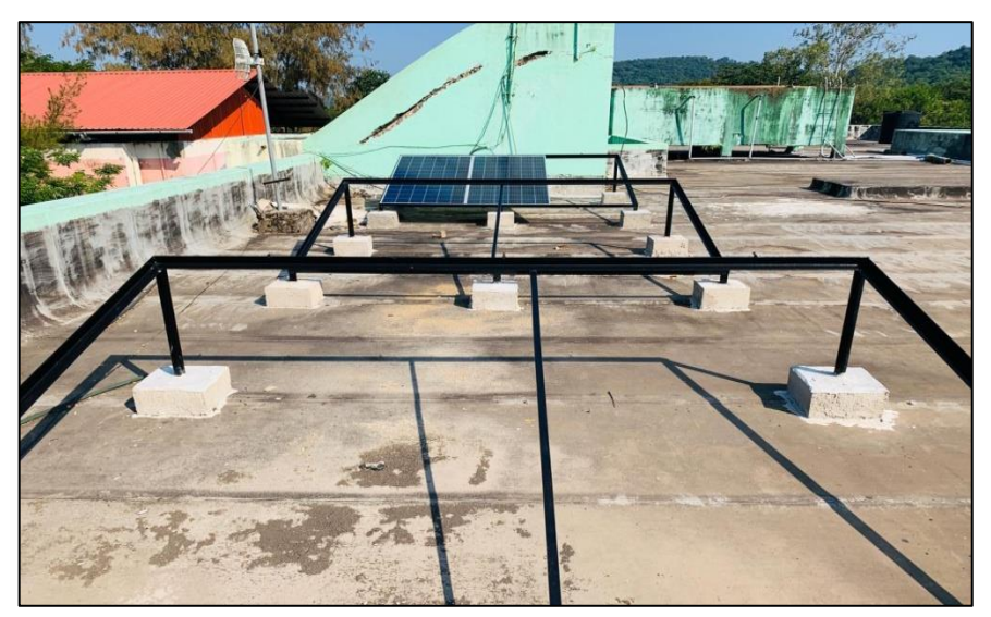
Stands used for supporting the solar panels