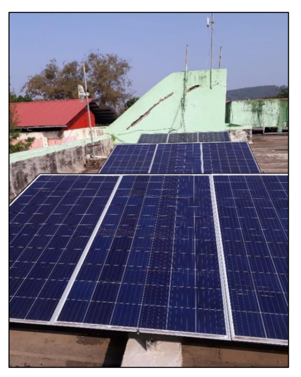
Mounted solar panels