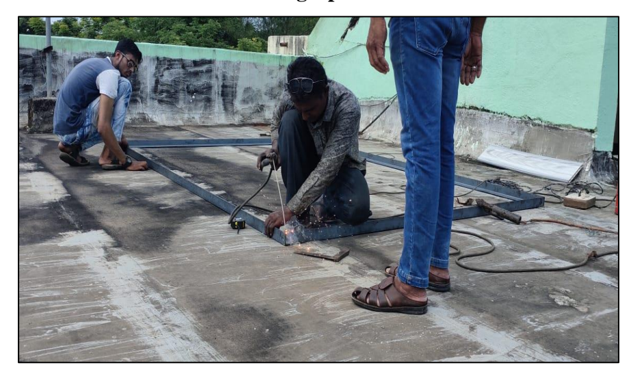
Shielding Arc welding of the frame