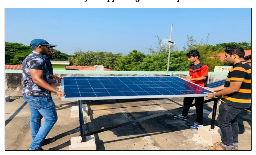
Mounting a solar panel