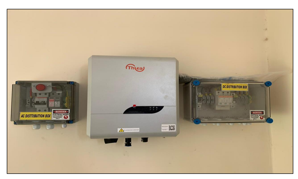
(L\ to\ R)\ AC\ Distribution\ box,\ solar\ inverter,\ DC\ distribution