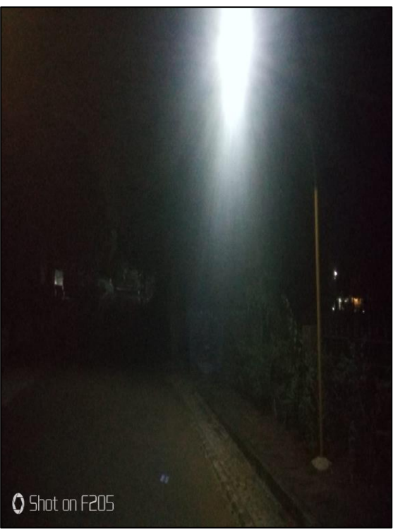
Panel for solar street light mounted on the pole and its illumination during light